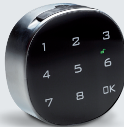
Keylezz® Turn Assign 4 digit code