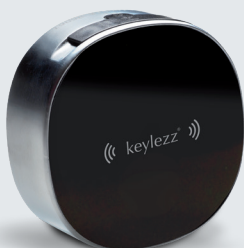
Keylezz® Turn Multiflex the allrounder