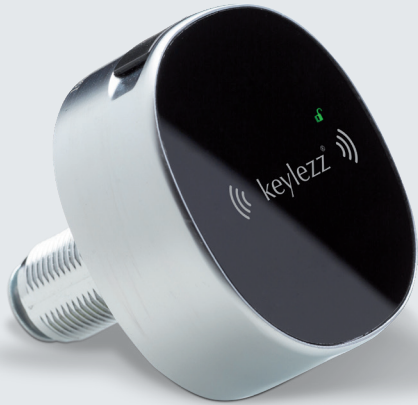
Patented furniture lock

Electronic furniture locks – Keylezz® Turn Basic Plus Item number: 5806705