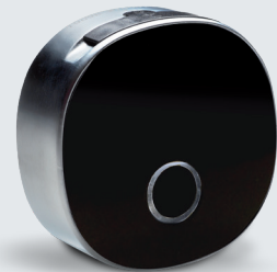
Keylezz® Turn „Biometrics" (fingerprint)