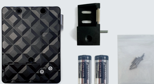
Keylezz® Latch Lock with accessories