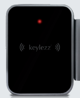
Keylezz® external antenna with LED light and power supply connector